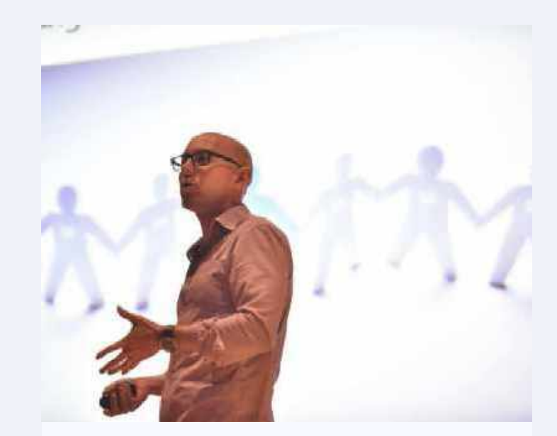
PSM1 Scrum Master