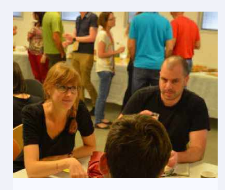
QQI Train the Trainer

DCM Members can avail of generous discounts on all certified courses.