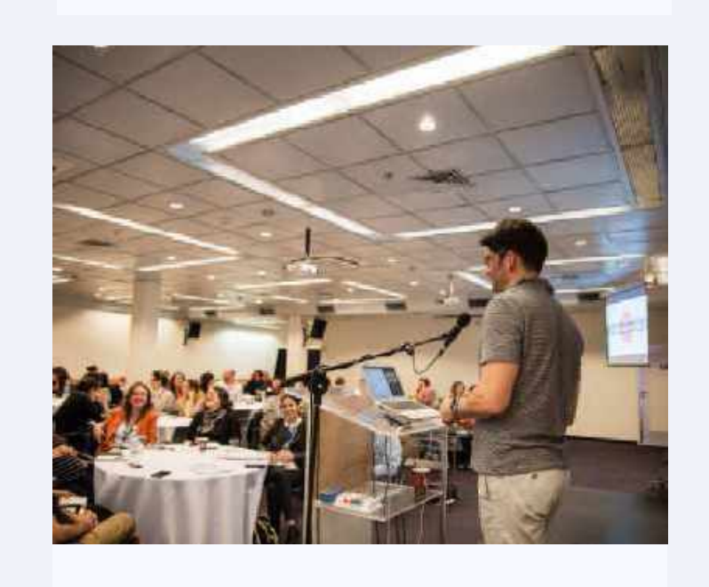
QQI Medical Secretary