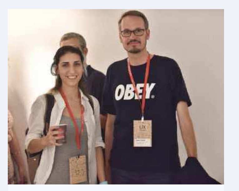
QQI Lean Green Belt