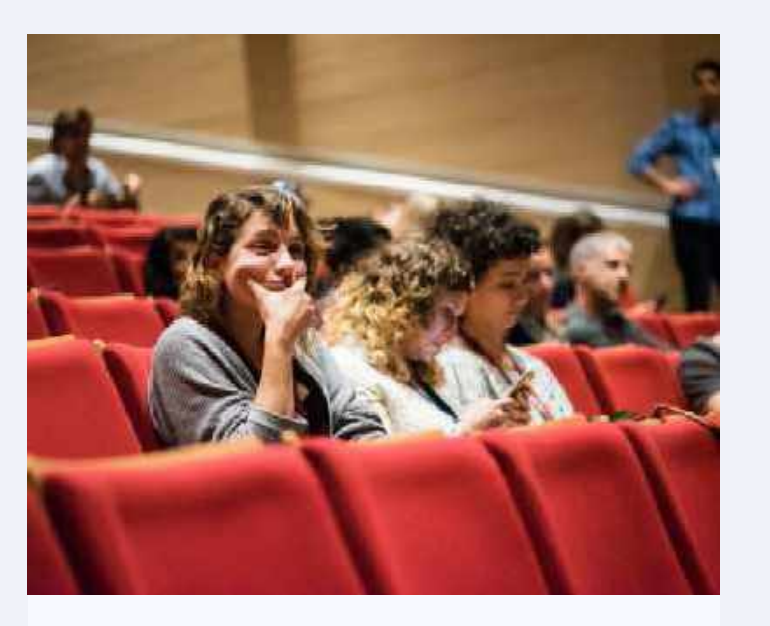
Lean Yellow Belt