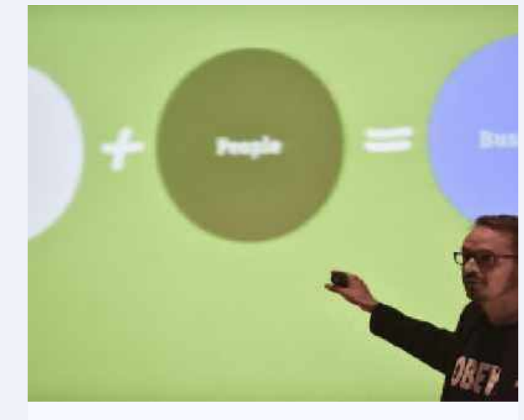
QQI Training Needs Identification & Design