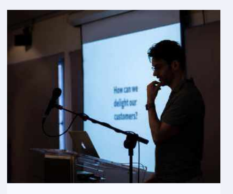
QQI Supervisory Management