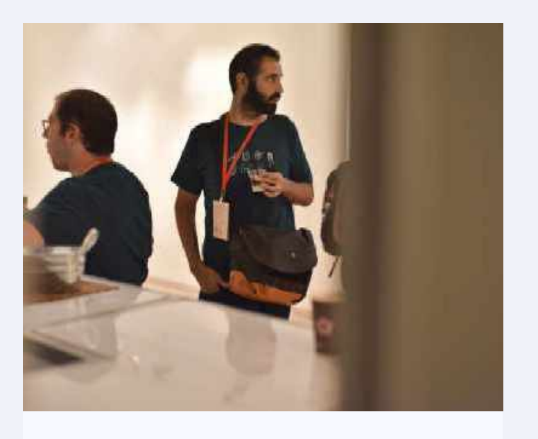
PSPO Product Owner